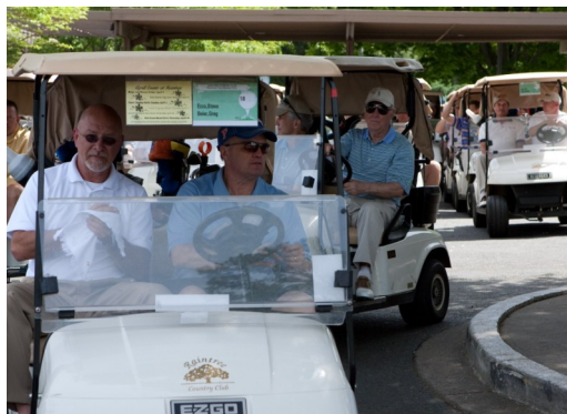
Golfers heading out to the course during the 2010 tournament.